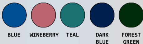
BLUE WINEBERRY TEAL DARK BLUE FOREST GREEN